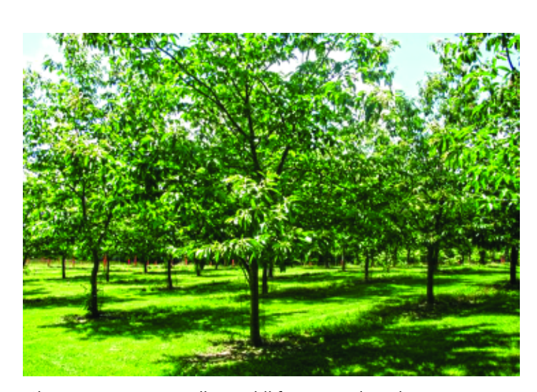
Chestnut trees are excellent wildlife trees and produce nuts most years.

The Harrison County Soil & Water Conservation District is considering placing a special pre-paid order for those who wish to buy a small number of the Dunstan Chestnut seedlings. Trees are container grown, 18" to 36" inches in height and the cost per tree is $20. (It should be noted that more than one tree will be needed for cross-pollination.) Delivery would be in January or February 2013 at the District office. If you are interested in participating, please contact the District office at 831-1647 or stop by the District office at 12238 Ashley Drive, Gulfport, MS, 39503.