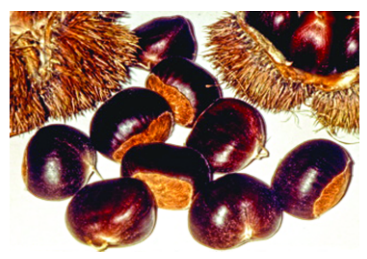
After being on the ground for a period of time, the outer shell of the chestnut starts to pop open.