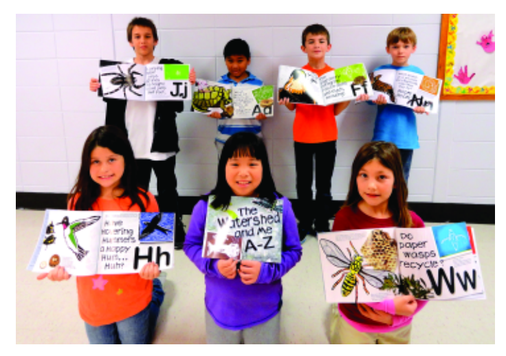
Third grade students at Quarles Elementary show some of the plants and animals that inhabit the Pascagoula River Basin in, "The Watershed and Me A-Z".